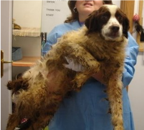
Rowan the day he was rescued. The dogs all looked like this and smelled horrible.

Once rescued, a new life emerged for the dogs: