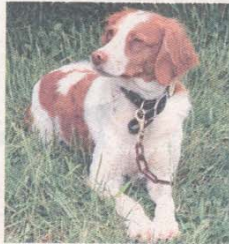
VICKI VELLIOS BRINER, The Patriot-News

Suddenly, one light brown and white dog stopped to focus on a brush